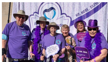
Pilgrim House at HopeFest